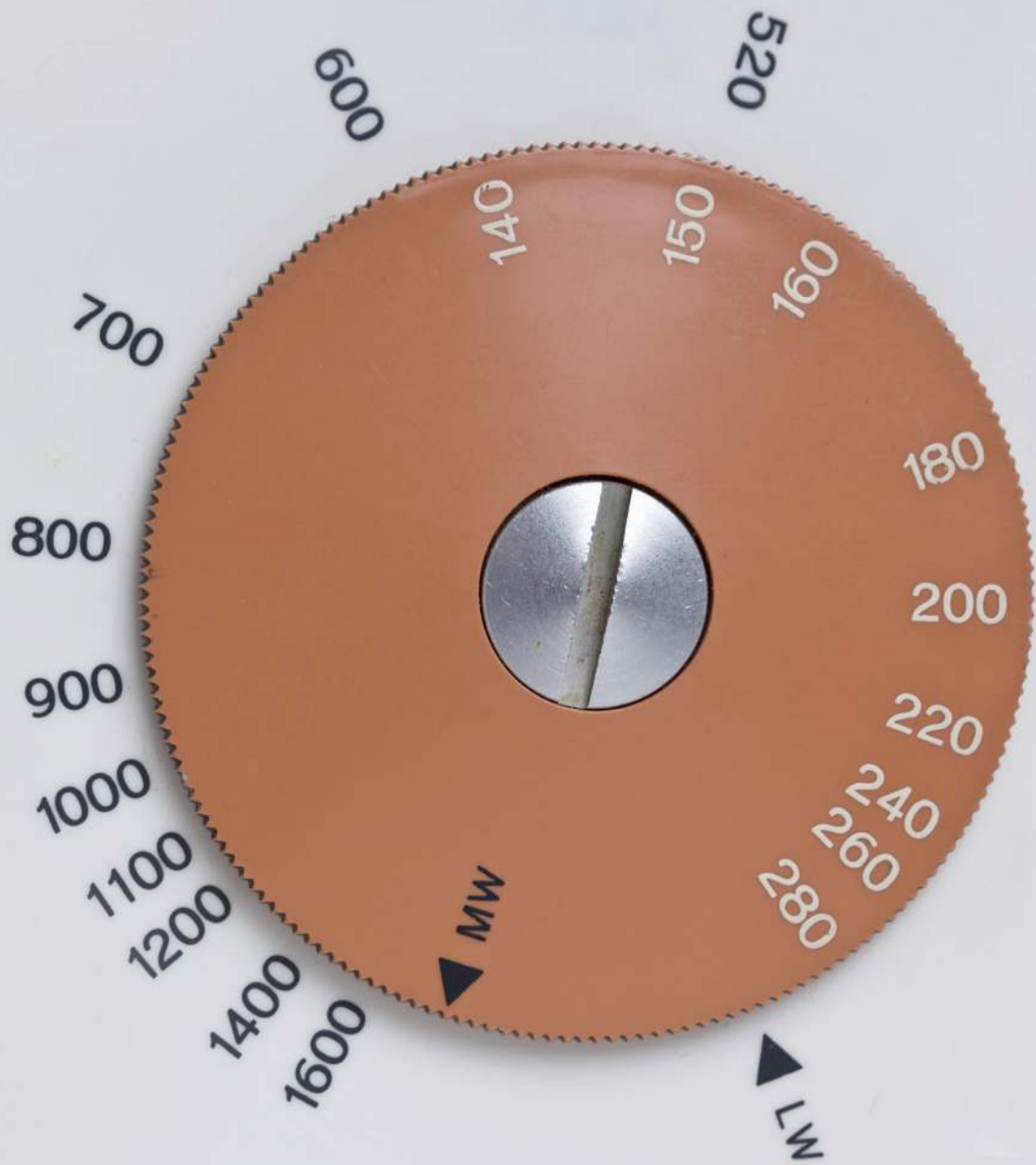
Portable Receiver exporter 2