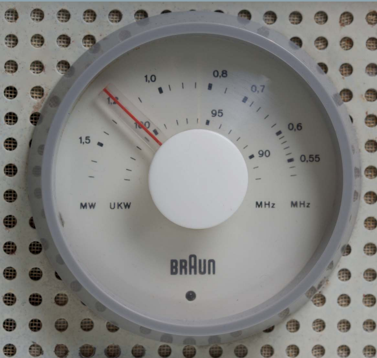
Table Radio SK 25