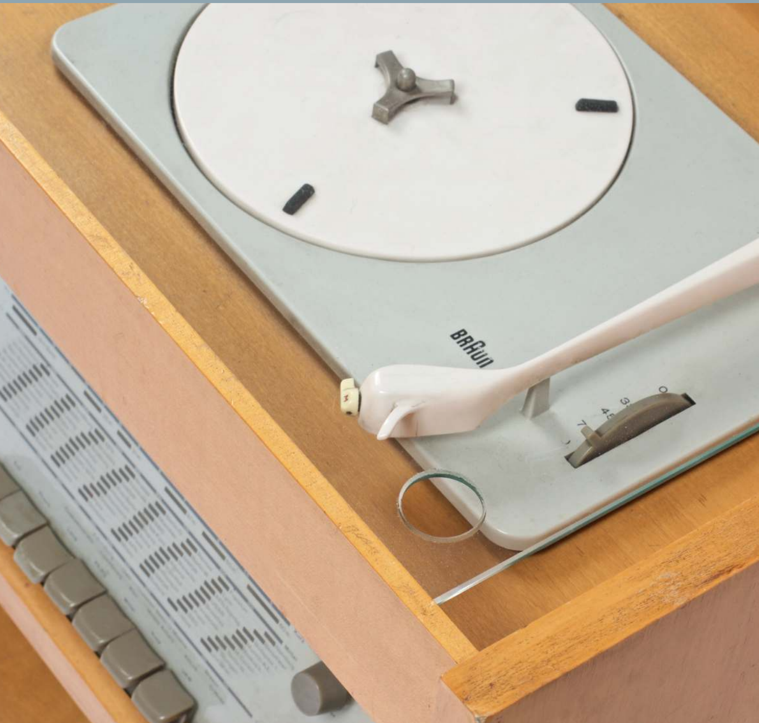
Radio-Phono Combination PK-G 4 1956. Hans Gugelot.